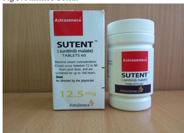
Fig 3. Falsified Sutent