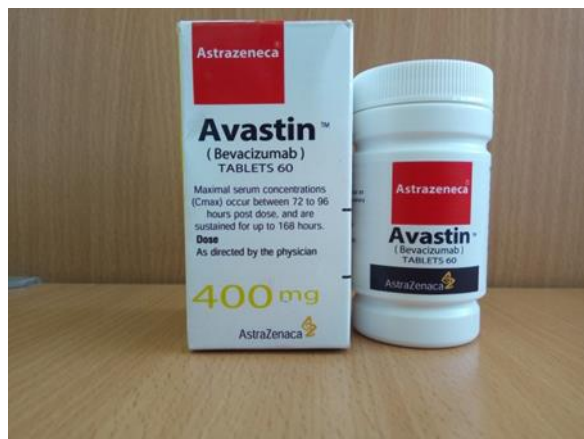
Fig 1. Falsified Avastin